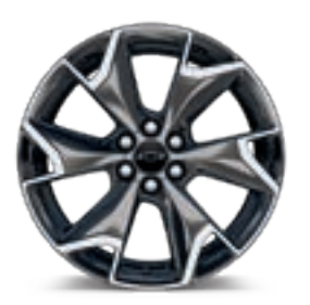
20" Machined-Face Aluminum Wheels with Dark Android-Painted Pockets Standard on RS