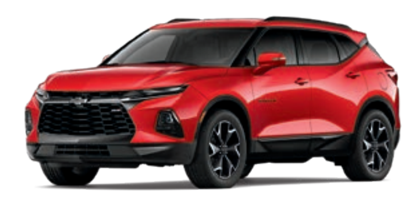
RS In addition to or replacing Blazer V6 with Leather features, this trim includes: