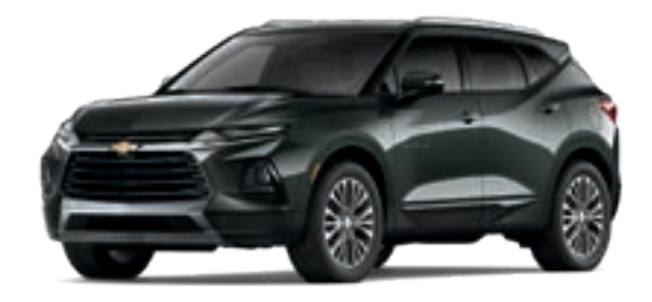
NIGHTFALL GRAY METALLIC<sup>1</sup>