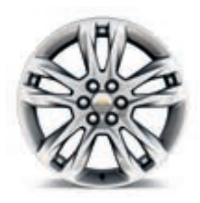
20" Bright Silver-Painted Aluminum Wheels Available on Blazer with Sun and Wheels Package