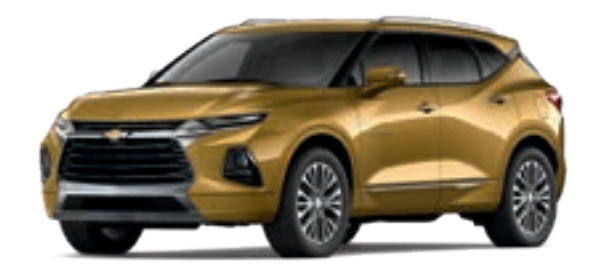
SUNLIT BRONZE METALLIC<sup>1,2</sup>