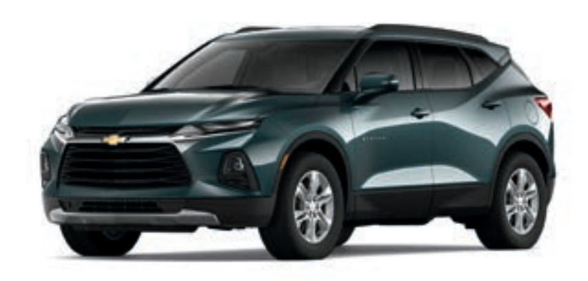
BLAZER WITH CLOTH In addition to or replacing L features, this trim includes: