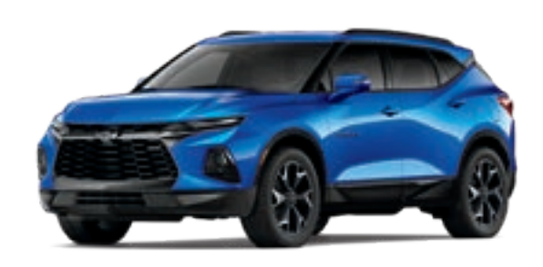
KINETIC BLUE METALLIC<sup>2, 5, 6</sup>