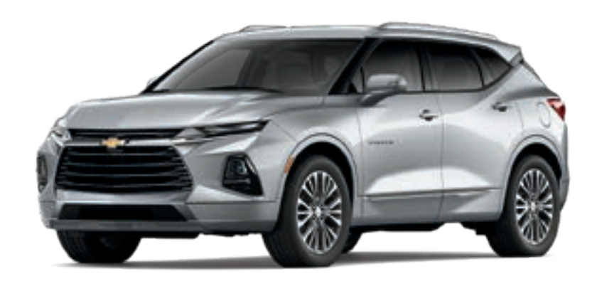
PREMIER In addition to or replacing RS features, this trim includes: