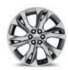
21" Pearl Nickel-Painted Aluminum Wheels Available on Premier with Sun and Wheels Package