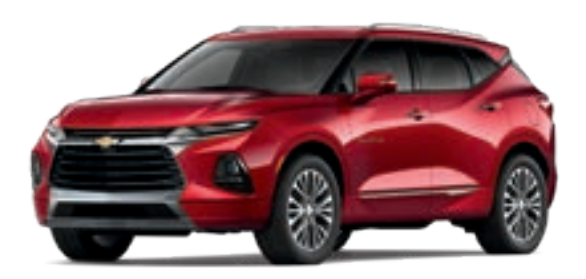
CAJUN RED TINTCOAT<sup>3,6</sup>