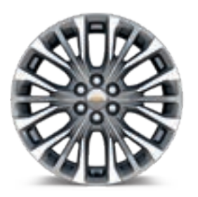
20" Machined-Face Aluminum Wheels with Medium Android-Painted Pockets Standard on Premier