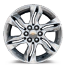
18" Bright Silver-Painted Aluminum Wheels Standard on Blazer