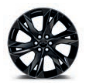
21" Gloss Black-Painted Aluminum Wheels Available on RS with Sun and Wheels Package

1 Chevrolet Infotainment System functionality varies by model. Full functionality requires compatible Bluetooth and smartphone, and USB connectivity for some devices. Map coverage available in the United States, Puerto Rico and Canada. 2 Go to my.chevrolet.com/learnAbout/bluetooth to find out which phones are compatible with the vehicle. Full Bluetooth feature functionality varies by device, model and software version. 3 Vehicle user interface is a product of Apple and its terms and privacy statements apply. Requires compatible iPhone and data plan rates apply. 4 Vehicle user interface is a product of Google and its terms and privacy statements apply. Requires the Android Auto app on Google Play and an Android compatible smartphone running Android 5.0 Lollipop or higher. Data plan rates apply. 5 Connected Navigation and Real-time Points of Interest (POI) only available on properly equipped vehicles. Requires paid plan or trial. Map coverage available in the United States, Puerto Rico and Canada. Visit onstar.com for details and limitations. 6 Available on select 2017 model year and newer GM vehicles with compatible hardware. Additional data plan rates may apply. Third-party trademarks are the property of their respective third-party owners and used under agreement. Requires active service plan and paid AT&T vehicle data plan or compatible device with 3G/4G LTE tethering data plan. Visit onstar.com for details and limitations.